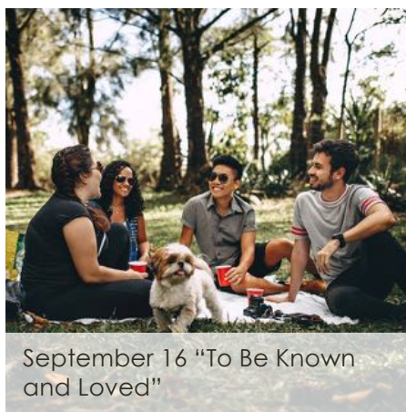
September 16 "To Be Known and Loved"