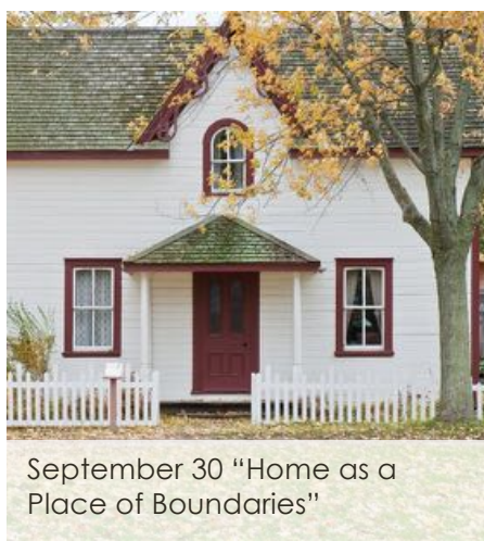
September 30 "Home as a Place of Boundaries"