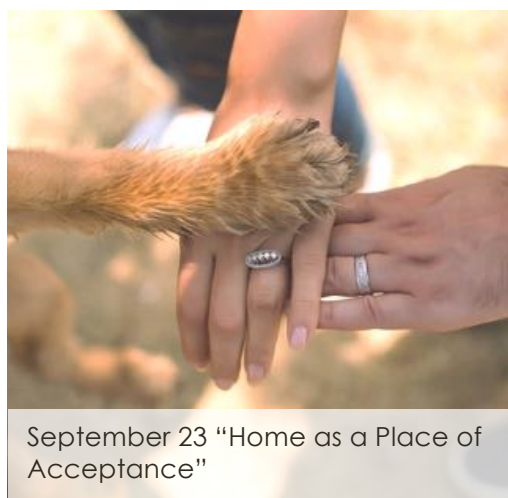
September 23 "Home as a Place of Acceptance"